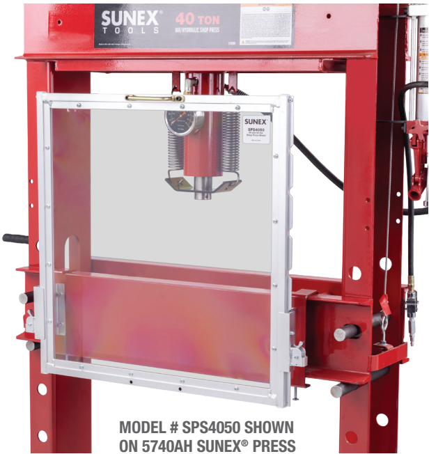
MODEL # SPS4050 SHOWN ON 5740AH SUNEX ® PRESS (PRESS NOT INCLUDED)