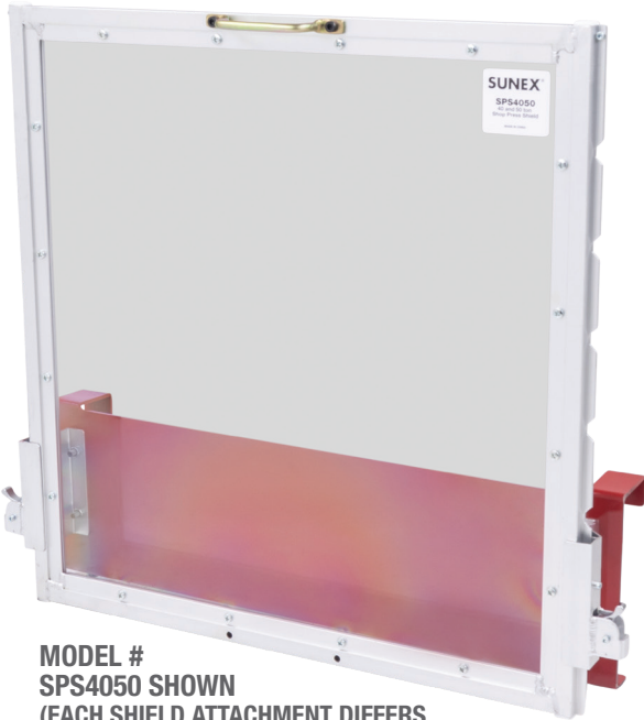
MODEL # SPS4050 SHOWN (EACH SHIELD ATTACHMENT DIFFERS SLIGHTLY TO ACCOMMODATE EACH PRESS)