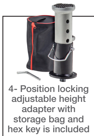
4- Position locking adjustable height adapter with storage bag and hex key is included

Premium grade durable nylon with non-slip grip handle for easy portability